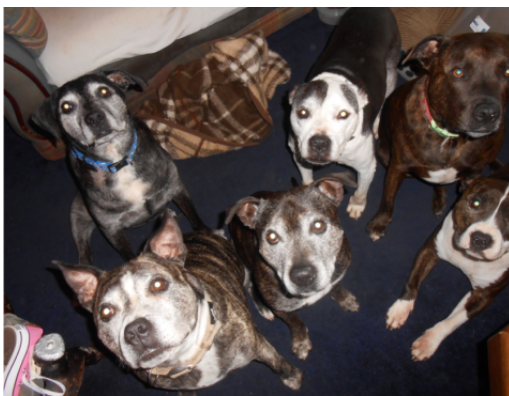
Bracken, Sasha, Odo, George with Spike and Alfie

The two resident dogs I have, Alfie and Spike, on the far right of this pic, have definitely helped to foster the dogs in, especially Alfie who mothers them all. I think they make them all feel safe. As the years have gone on, I have got more involved with LCH. I do occasional home checks, but now run the online auctions to help raise funds for LCH and also still bake many cakes for them. I still work full time and