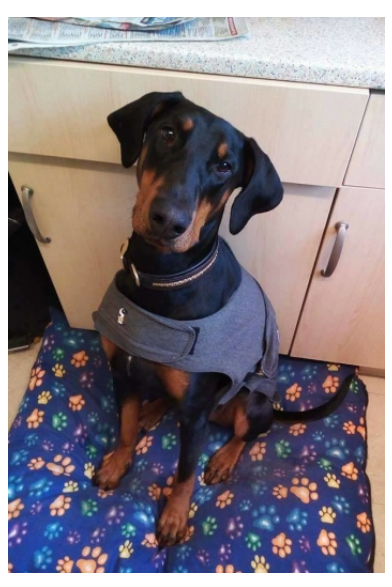
Far top: Pippin. From top left, clockwise - Riley, Honey, Loki, Alfie, Fergal, and Ralph