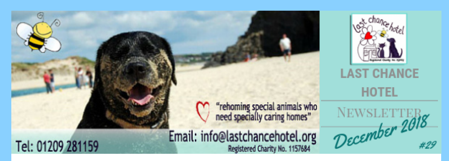
If you would prefer to read the newsletter in your browser, please click at top right

Last Chance Hotel is very fortunate in having an amazing supporter base, and our Facebook group, like waistlines at Christmas, is continually expanding. The more proactive supporters come up with all sorts of fundraising ideas; this year there has been a musical evening at St Agnes, Snowdrop Sunday at Pencarrow Gardens near Bodmin, several quiz evenings at various venues, a disco and buffet, a flash day at Shoreline Tattoo, Cornwall VW Owners Club annual jamboree, a tarot reading afternoon, many wonderful dog shows on our behalf, a sponsored silence, and just recently, a clairvoyance evening, to mention just some of them. We are ever grateful to those who find ways to raise funds for our vet bill, by far and away our biggest expense due to so many poorly animals coming into our care. As a responsible rescue, once we take an animal under our wing, that living breathing creature is given every chance of a happy life, and we will always do our utmost to protect, heal, and nurture.