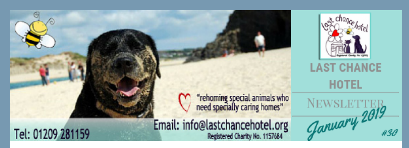
If you would prefer to read the newsletter in your browser, please click at top right