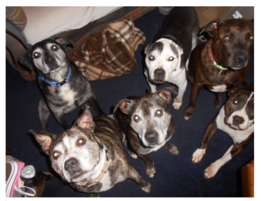
Bracken, Sasha, Odo, George with Spike and Alfie

at my house. It hasn't all been easy though. I have had my kitchen chewed by the puppies, door frames and skirting boards, one of my oldies chewed my two seater sofa, I have been through numerous dog beds, pillows, cushions and duvets etc, but it is all just material items. Who cares about that when there is a life involved.