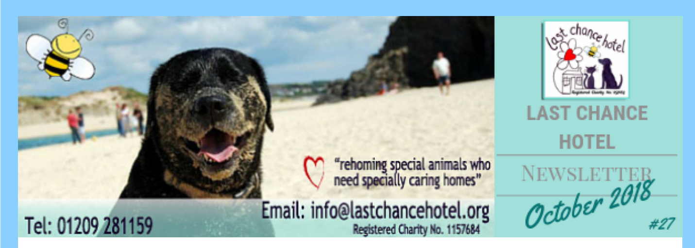
If you would prefer to read the newsletter in your browser, please click at top right

Chilly, autumnal mornings and ever shortening days, - October is here and it's time for a round-up of the news from the last month. What a mixture too, more pooches coming into rescue, happy endings, Gotcha days, a sunny dog show, and the terrible heartbreak of loss after fighting against the odds.