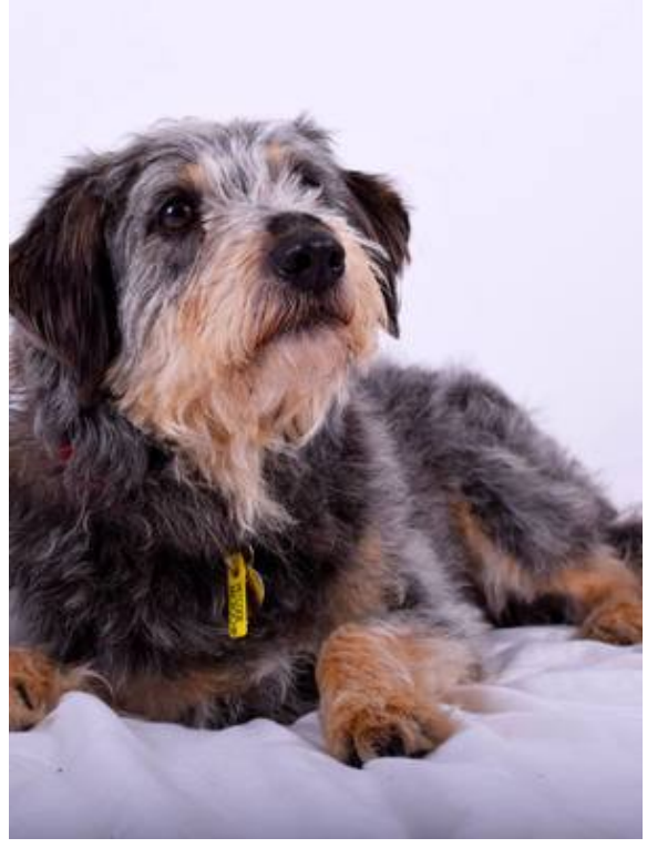
Until next time......woof woof from all the LCH dogs!